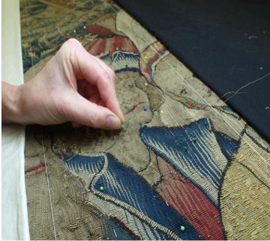
Treatment of a 15 th century Tapestry

this meeting is open to all with free admission