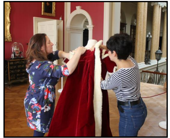
Dressing the mannequin at Ickworth

This meeting is open to all with free admission